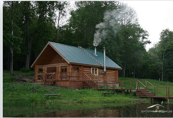
Holiday Base “Nalitovo”