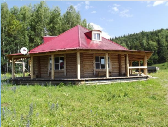
Holiday Base “Aksaur”