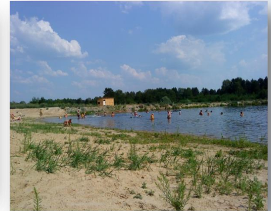
Holiday base “Nadezhda”